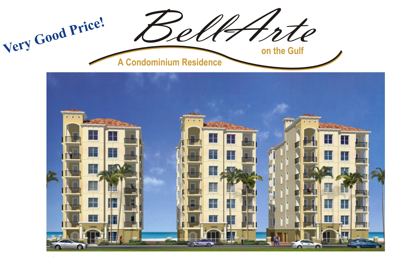
BellArte "Beautiful Art" A Premier building on Madeira Beach. Seventeen exquisite residences, each offering 3 Bedrooms, 3.5 Baths with optional study/family room/media room. Situated on 260 feet of the sugar white sands of Madeira Beach Florida. Spacious and Light! Each residence at BellArte stands alone with only one residence per floor!